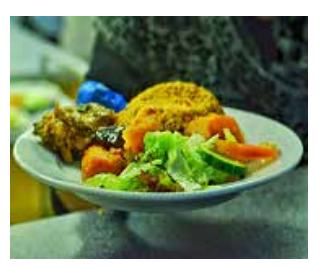
Website: <u>www.diwc.co.uk</u> Twitter: <u>@diwc1969</u> Facebook: <u>facebook.com/</u> <u>diwc1969/</u>