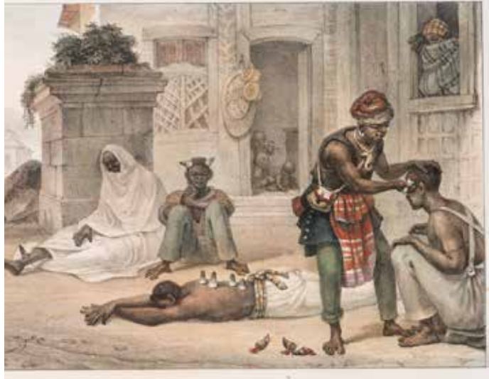
LE CHURDROIES DECRE.