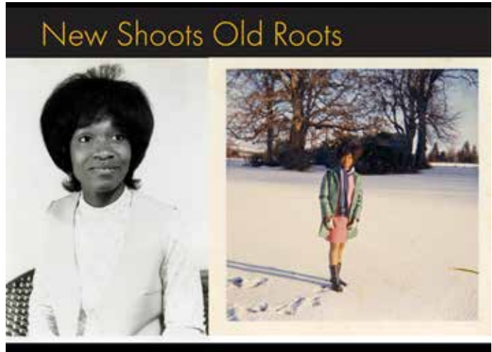
Celebrating 7 decades of African and Caribbean women in Scotland

An event to celebrate African-Caribbean women in Scotland across seven decades. The schedule for the event will include readings, entertainment with African dance, African Children's Choir, food and refreshments.