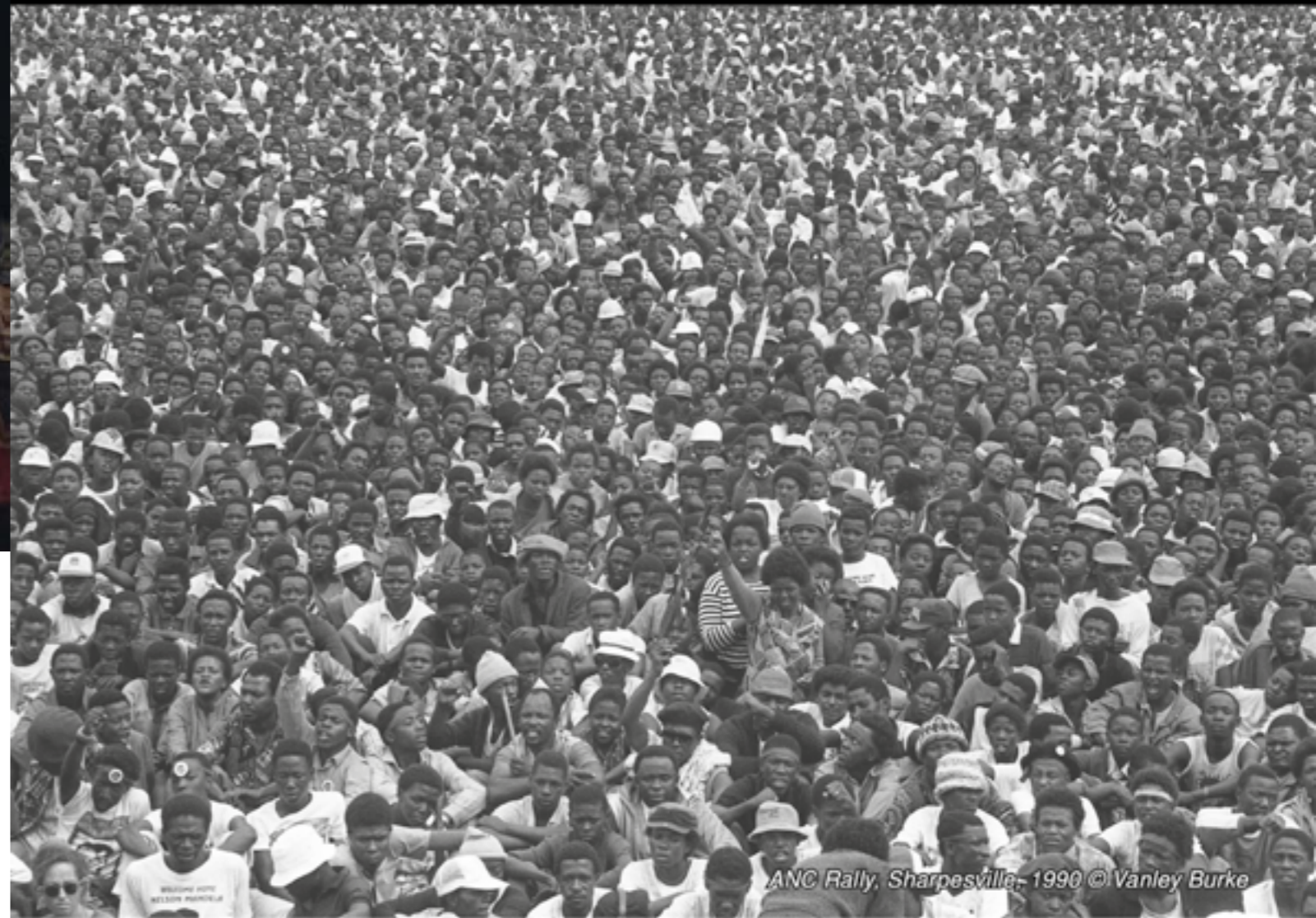
ANC Rally, Sharpeville, 1990