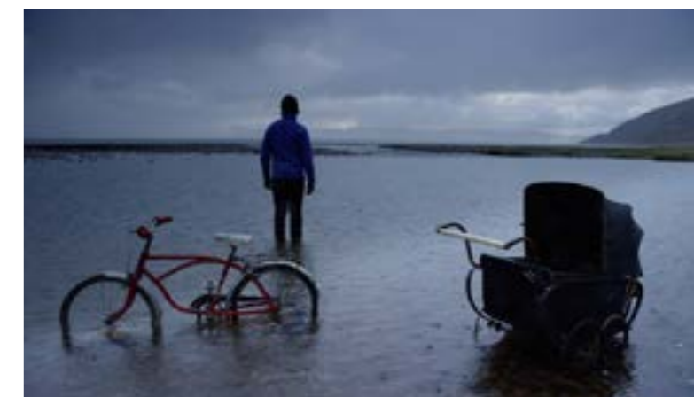
Images: John Akomfrah, Vertigo Sea, 2015