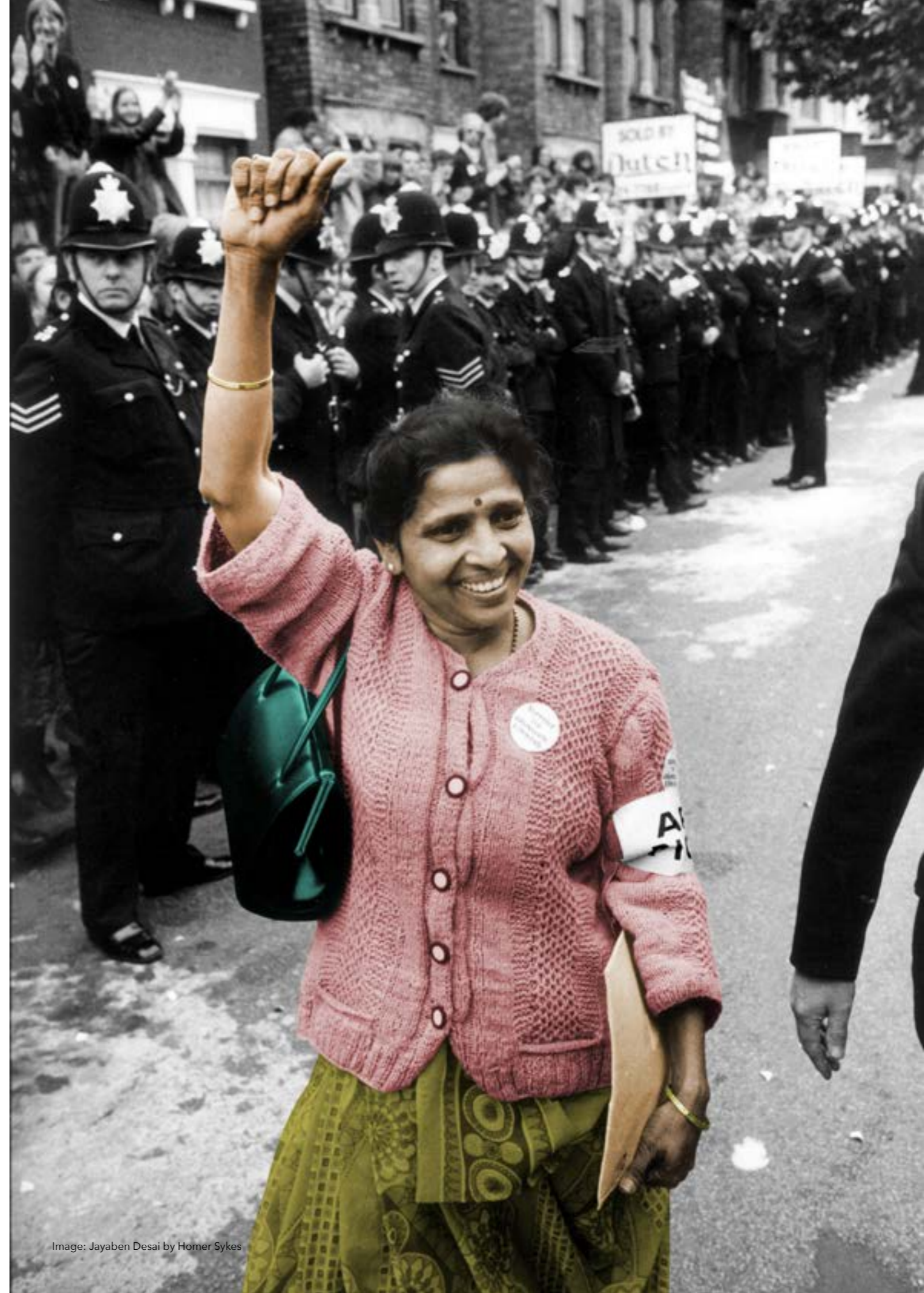
Image: Jayaben Desai